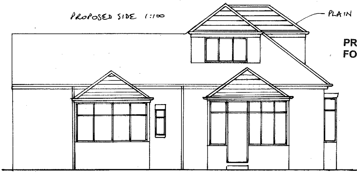
PROPOSED SIDE 1:100